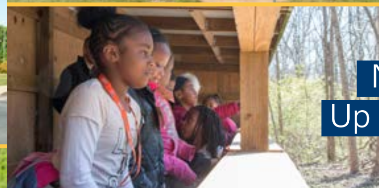
Nature Up Close