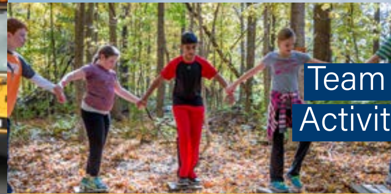
Team Building Activities