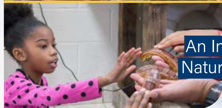
An Interactive Nature Center