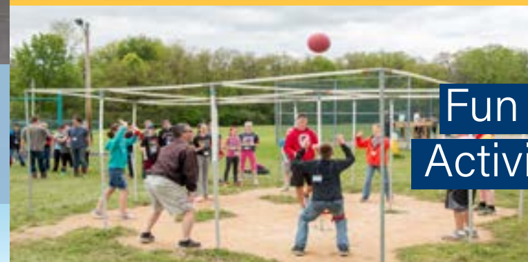
Fun Evening Activities